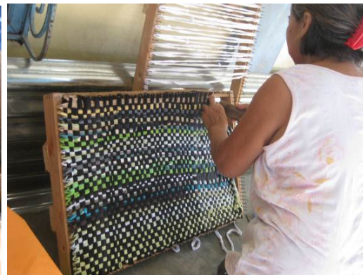
Doormat Making in Cavite