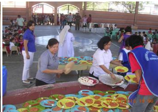
Feeding program in Putatan, Muntinlupa conducted by the Muntinlupa Gospel Church