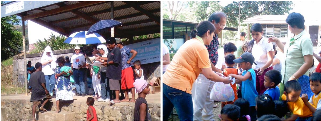
Gift-giving with the Aeta community in Zambales

The gift-giving activities were undertaken in coordination with various non-government agencies, local government units, social welfare and development office and other private individuals in various sectors in the Philippines.