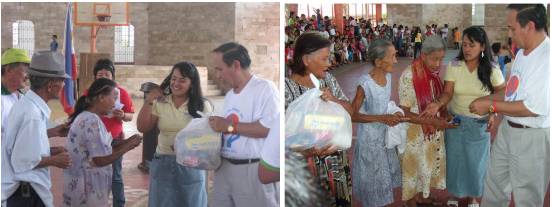
Gift-giving in Padre Garcia, Batangas