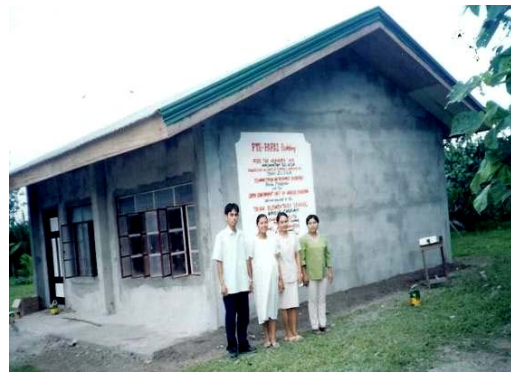
Tayak Elementary School - Cagayan