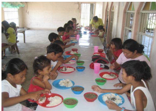
Feeding program in Castillejos, Zambales conducted by the Lingap Pangarap Foundation