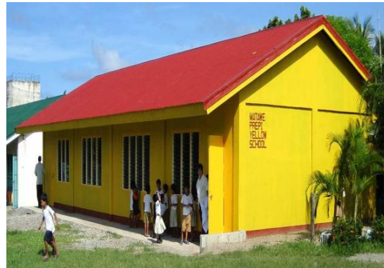
Matawe Elementary School - Aurora