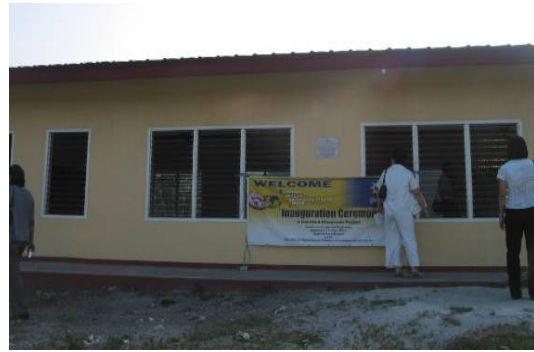
Florentino Joya Elementary School - Cavite