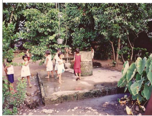
Water well system in Torrijos, Marinduque