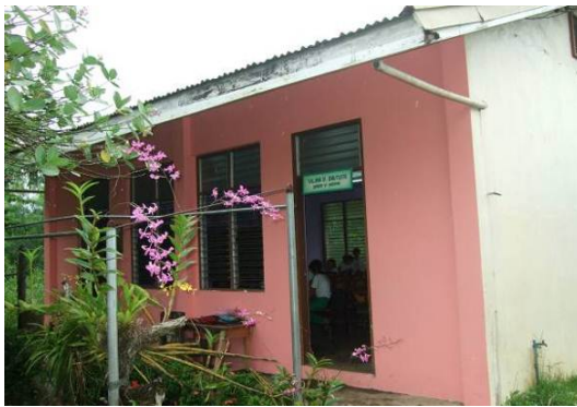
Timalan Elementary School – Cavite