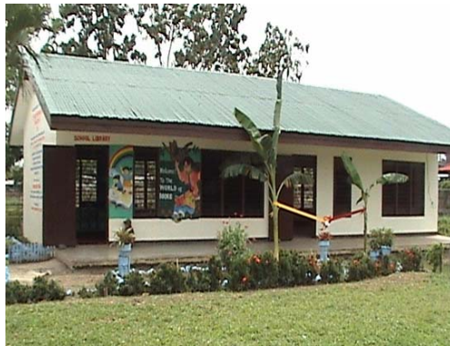
Sayon Elementary School – Agusan del Sur