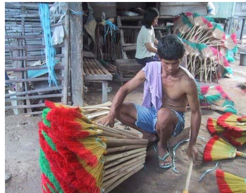
Women Broom Making Project in Mandaue, Cebu