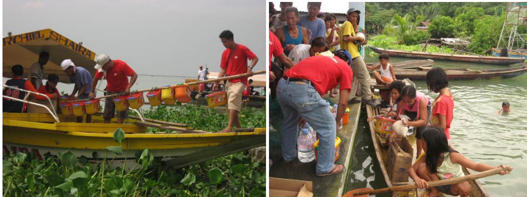
Relief Operation to families affected by typhoon Ondoy & Pepeng in Talim Island, Rizal in 2009