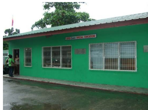
Rosario Elementary School - Cavite