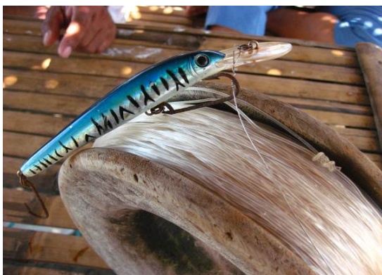
Payaw Fishing in Aklan