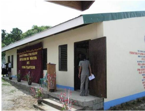
Ueg National High School – Isabela