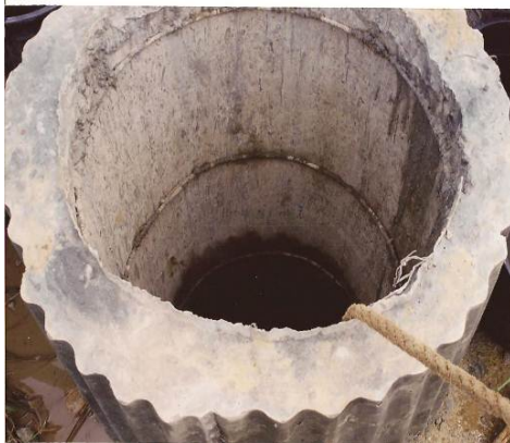
Deep well in Sta. Rita, Pampanga