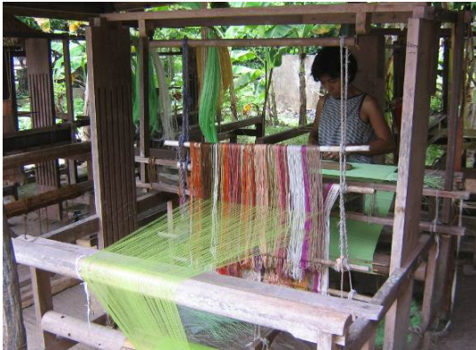
Loomweaving in Marinduque